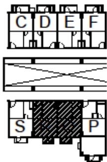
TOWER 1 KEY PLAN